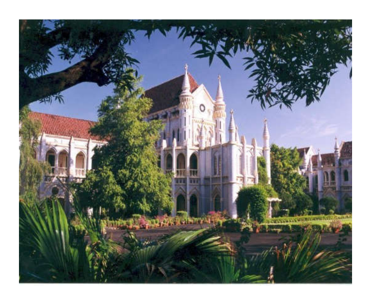
Bid Document for

Ref.No.Reg(IT)(SA)/2025/157 Dated: 27/01/2025